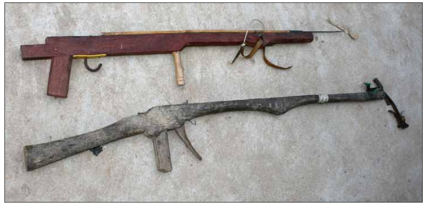
Plate 8. Wooden harpoon guns for frog hunting seen in a village in Aural district.