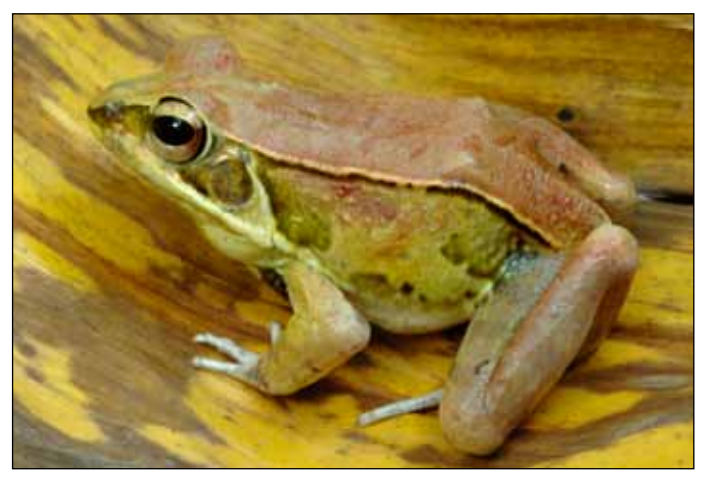
Plate 5. Rana lateralis