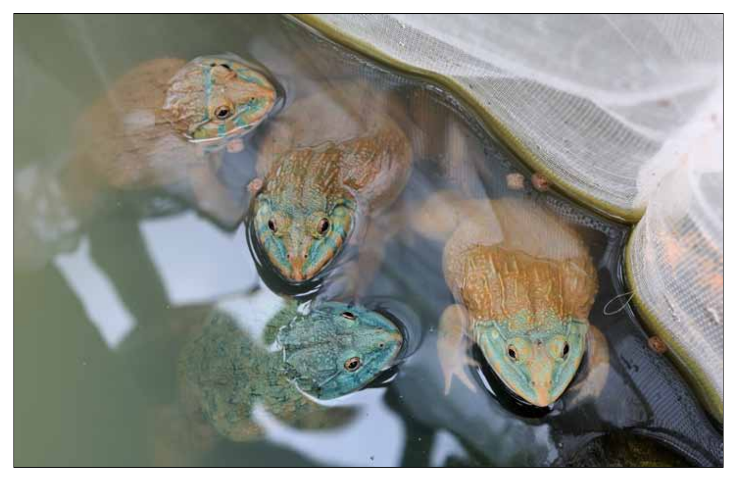
Plate 14. Hoplobatrachus cf. in a frog farm in Takeo province.