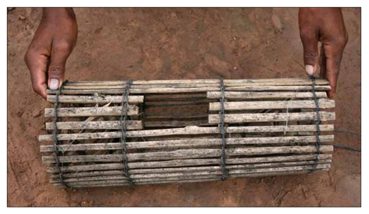
Plate 7. Wooden gill trap used to capture frogs.

During the short dry period of early wet season in Takeo province, frogs are caught when farmers pump water from deeper canals into their paddy fields to seed or transplant rice. This flooding is similar to a heavy rain event as far as the frogs are concerned and they come out from their shelters and congregate in the flooded areas to breed. Both Hoplobatrachus and Fejervarya are collected in this way.