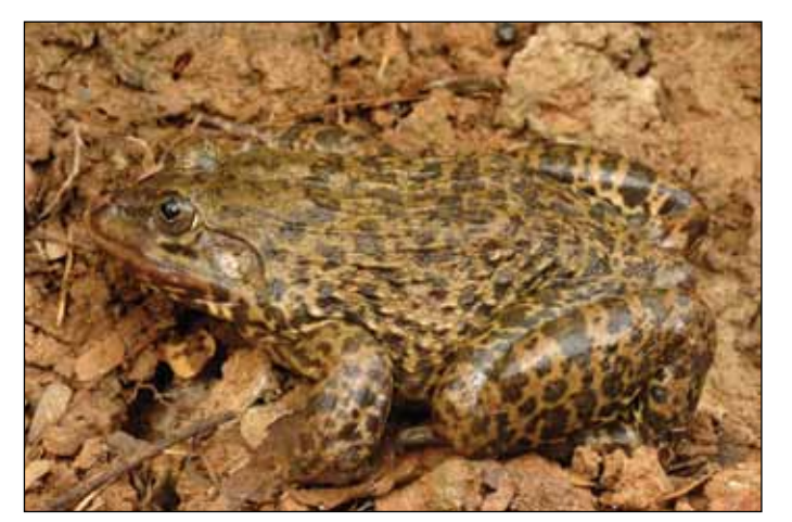
Plate 1. Hoplobatrachus rugulosus

Frog species commonly collected for consumption and trade in Cambodia