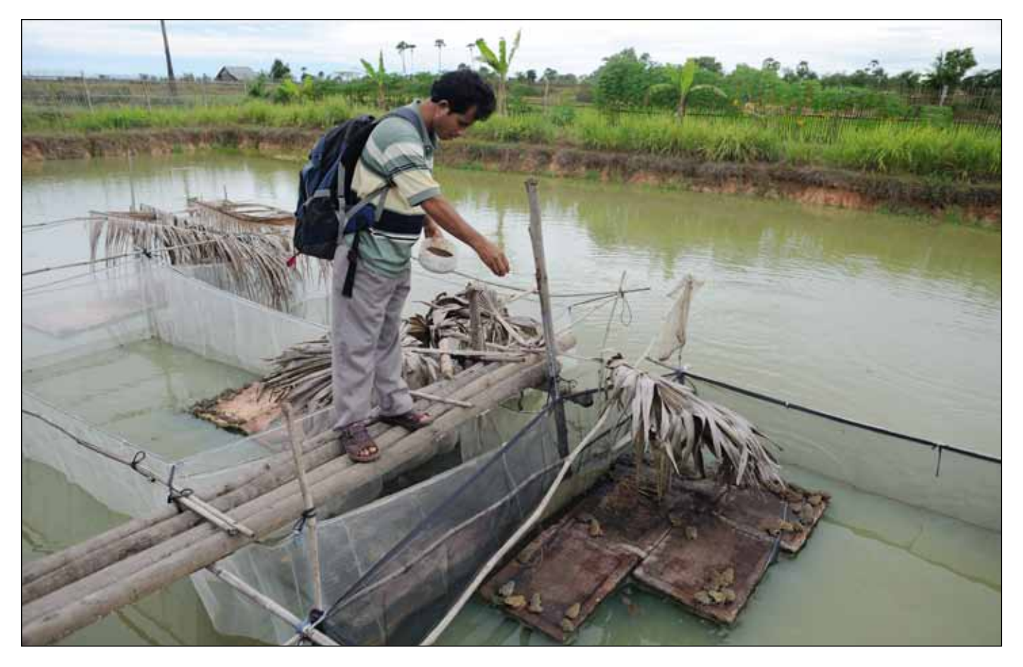
Plates 12 & 13. Frog farm in Takeo province.