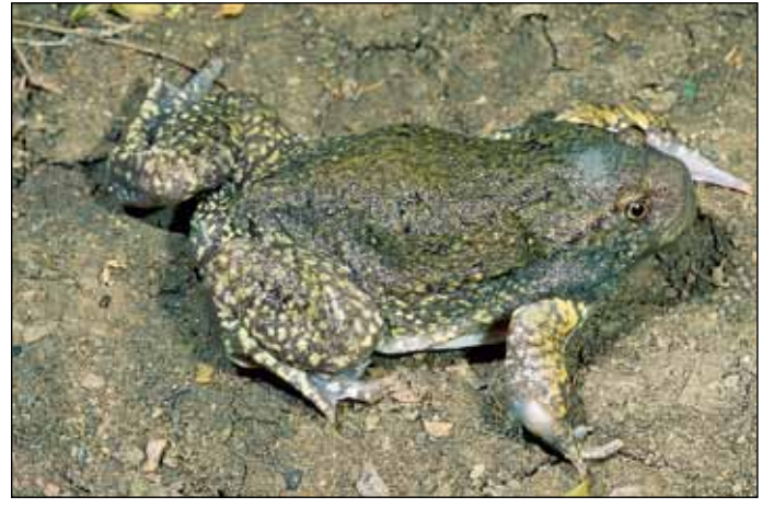
Plate 3. Glyphoglossus molossus