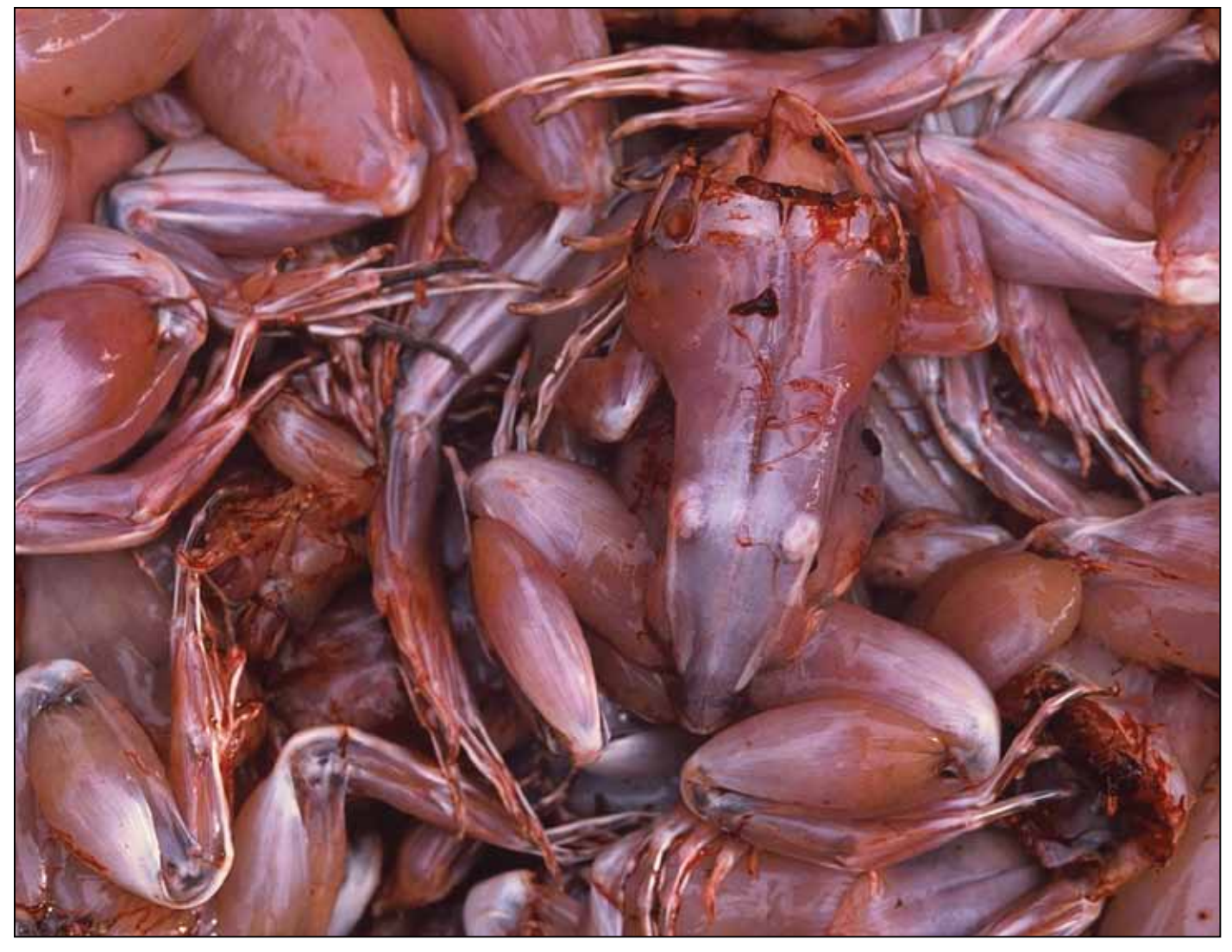
Plate 7. Skinned Hoplobatrachus in a Phnom Penh market. Provincial traders sell live frogs; market vendors sell skinned frogs with cranium removed.