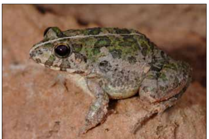
Plate 2. Fejervarya limnocharis