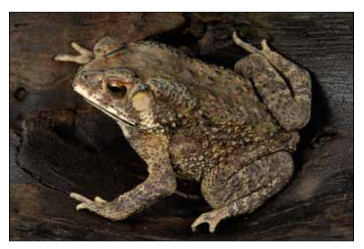
Plate 6. Bufo melanostictus