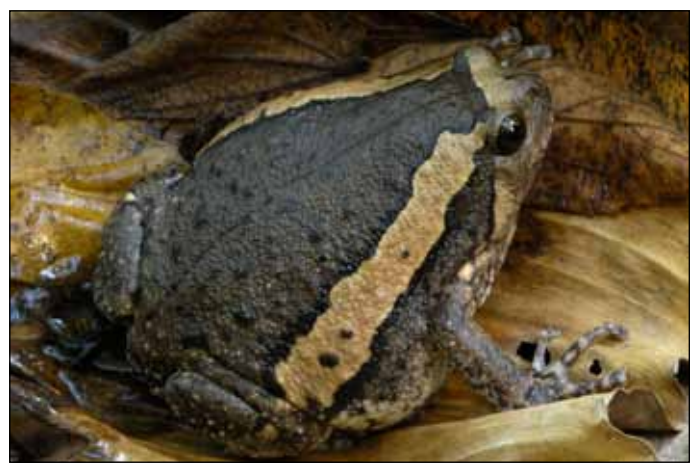
Plate 4. Kaloula pulchra